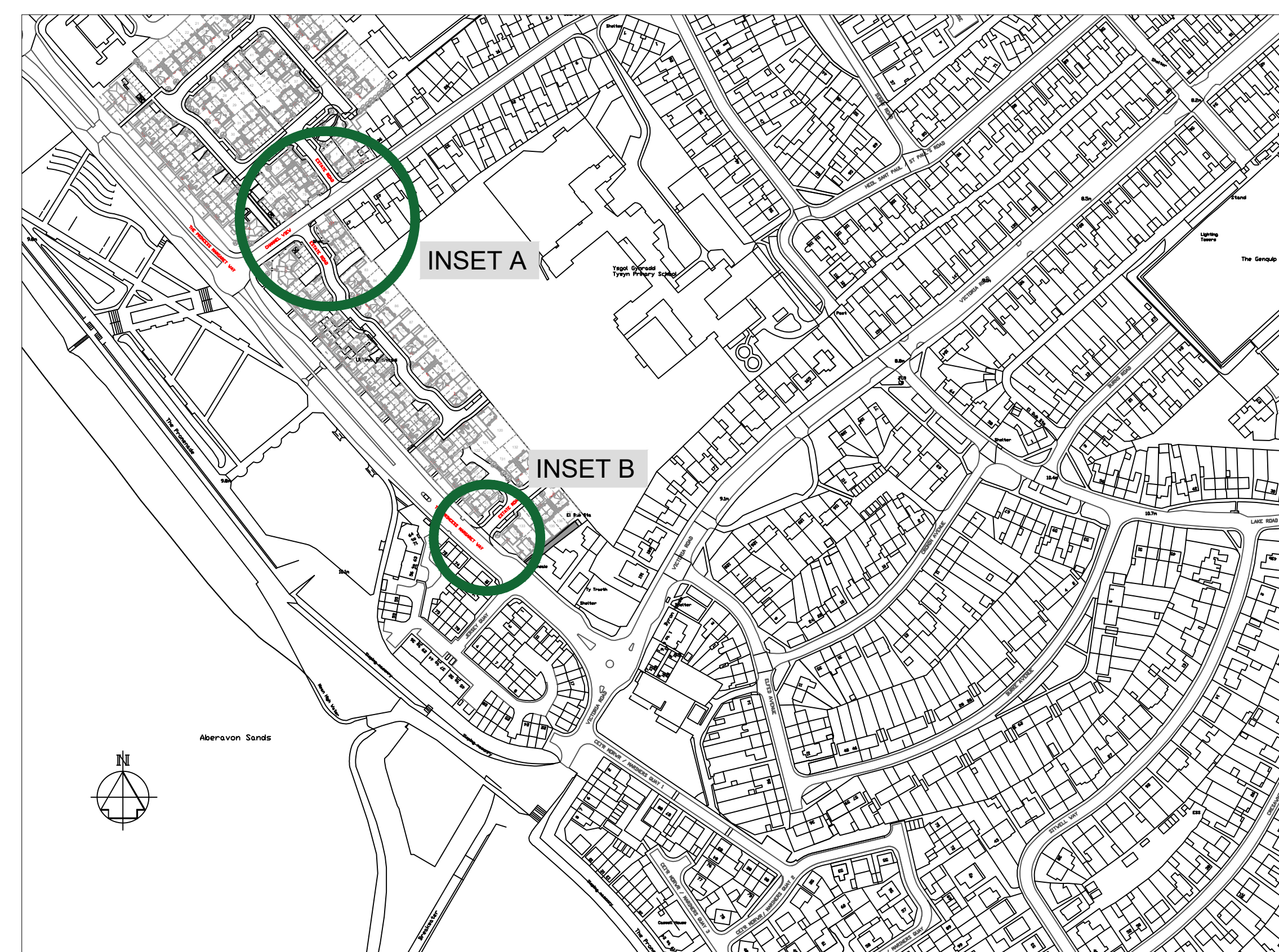
SITE LOCATIONS - SCALE 1:2500 @ A1